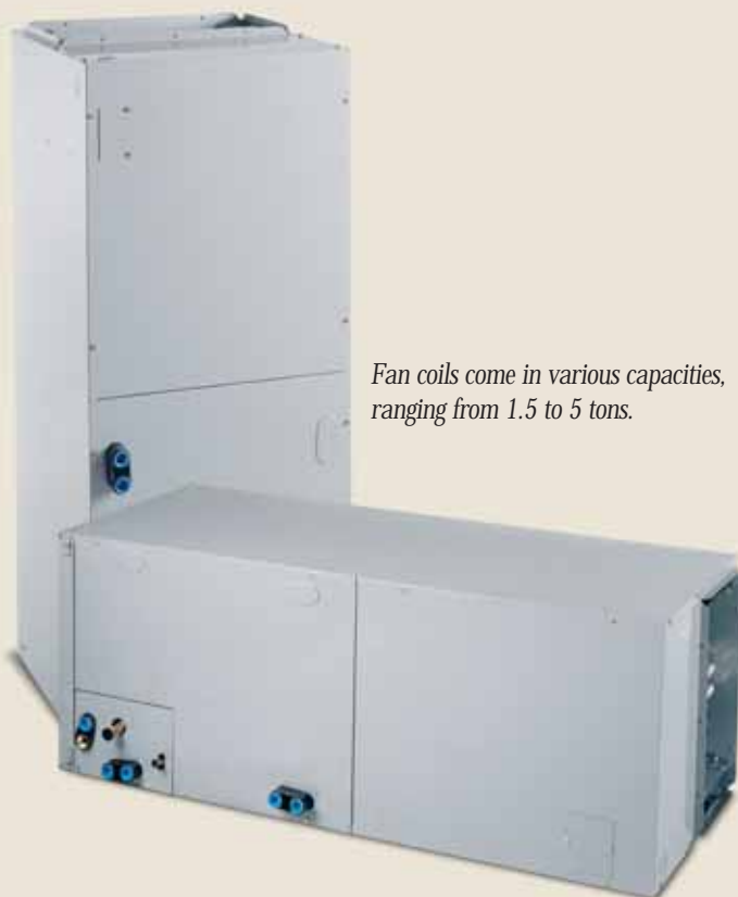
Fan coils come in various capacities, ranging from 1.5 to 5 tons.